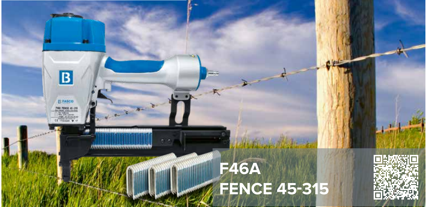
F46A FENCE 45-315